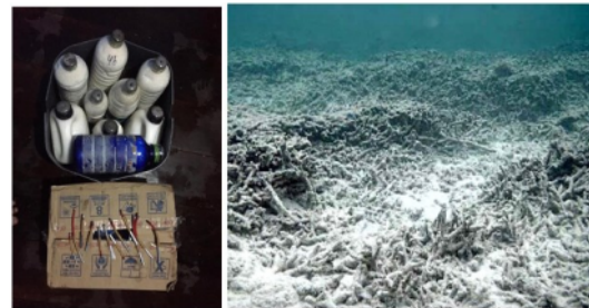
Figure 4. (a) The fish bombs; (b) The damage of fish bombs. Fish bombs are packaged in bottles of mineral water, containing ammonia nitrate and detonators. The data is taken from the South Sulawesi Marine and Air Police Documentation.

Based on the above-mentioned cases, all of the perpetrators were imposed with a minimum sentences, with an average sentence of 2 years in prison and a fine of IDR 2 billion for coral mining in conservation areas, and 7-8 months imprisonment with a fine of IDR 1 million for violations of the Fisheries Law.