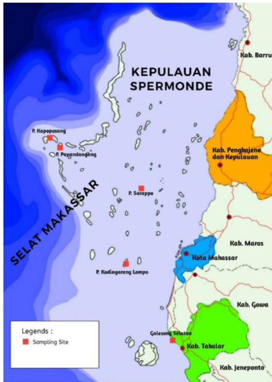
Figure 1. The map of the study sites. Spermonde Archipelago is located in Makassar Strait. (Source: Marine and Fisheries Agency of South Sulawesi: Kench and Mann 2017; Modified by authors).

management plan and zoning plan; decision making by the Minister. Pangkajene Regency and Island Region Water Conservation Area were established based on the Regent Decree No. 209 of 2015.