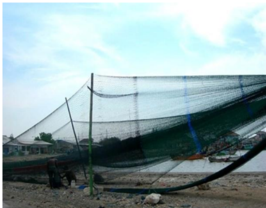
Figure 3. Cantrang net. The cantrang is lowered to the sea bottom and pulled by the ship. Its destructive power will damage the coral reefs.

The selected 26 convicted cases could be categorized into three forms of environmental law violation as described in table 2.