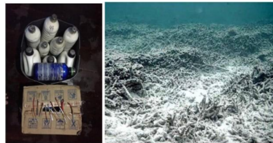
Figure 4. (a) The fish bombs; (b) The damage of fish bombs. Fish bombs are packaged in bottles of mineral water, containing ammonia nitrate and detonators. The data is taken from the South Sulawesi Marine and Air Police Documentation.

Based on the above-mentioned cases, all of the perpetrators were imposed with 12 minimum sentences, with an average sentence of 2 years in prison and a fine of IDR 2 billion for coral mining in conservation areas, and 7-8 months imprisonment with a fine of IDR 1 million for violations of the Fisheries Law.