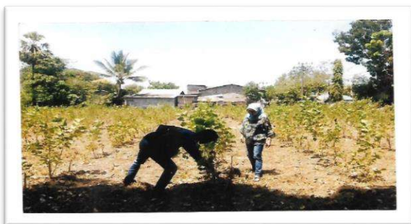
Figure 2. Mulberry Plant Cultivation in Pakkatto Village