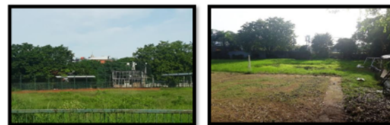
Fig. 8. Softball and Volleyball fields.

The low performance recorded in categories H and I was due to existing facilities not supporting their implementation properly. This is indicated by the lack of good seating facilities for people to sit comfortably and chat casually with family or friends, the plants also do not have an attraction to be enjoyed, besides that the facilities for sitting are around soccer sports activities which have a risk of being hit the ball from a kick that goes off the field. Sitting and chatting activity situations are presented in Fig. 9.