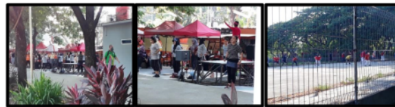
Fig. 7. Gymnastic activities.

which is interpreted as carrying out incidental activities once a day. The low performance for this sport is because Softball is not very popular in the city of Makassar, and the majority of enthusiasts are from certain segments of youth, namely the middle and upper economic groups. This sport is seen to have sufficient activity if there are leaders from both the government and the private sector in Makassar City who have a former athlete's background or have an emotional bond with this sport so they have special attention to developing it. The weakness of this condition is that if the leader who has the attention switches or moves, this sport will return to being passive. This condition also occurs in volleyball and other unpopular sports. The situation for gymnastic activities in the GOS Karebosi Field Complex is shown in Fig. 8. From left to right the Softball and Volly fields with weeds grow to indicate that there has never been activity on it according to its designation.