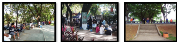
Fig. 9. Sitting activity (source: Research documentation).

Fig. 9 shows the seating facilities used on Sundays by visitors after finishing jogging. In the picture, from left to right, the first and third pictures are seats made of concrete, while in the second picture, visitors use a jogging track to sit, because they don't get a seat on the existing seats. The Scalogram table also shows that non-sporting activities have lower performance compared to sporting activities. This means that GOS is more dominated by sports activities, not for recreation related to relaxing with family and friends, less of an option.