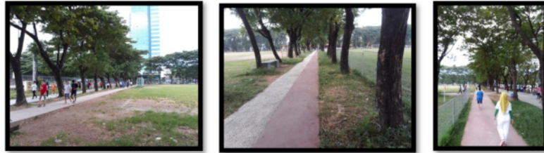
Fig. 4. Jogging activities (source: Research documentation).

There are also several soccer school groups for children of various ages based on age group categories regulated by the Indonesian soccer organization. Some of the soccer participants at the Karebosi Field had the achievement of becoming Makassar Football Association (PSM) players and some even took part in the Indonesian Football Association (PSSI). Football is a very popular sport in Makassar and several Indonesian football legends originate from Makassar city. Soccer activity is shown in Fig. 5.