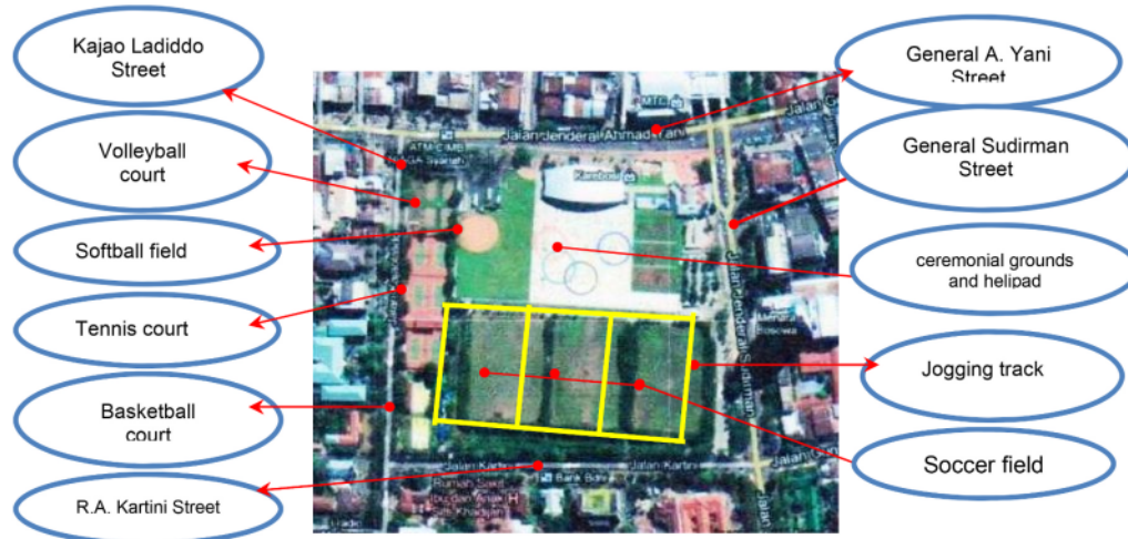
Fig. 3. The Sports Facilities in the GOS of Karebosi Field Complex.