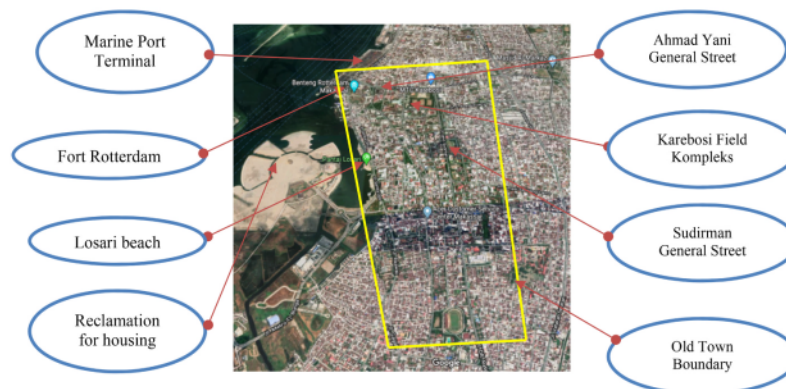
Fig. 2. The position of the Karebosi field complex in Makassar city.

It is hoped that this study will help fill the gap described by (Bell et al., 2008), which states that more methods are needed to better assess the quality of GOS development. This study measures the social GOS performance of the Kareboshi Field Complex by observing the intensity