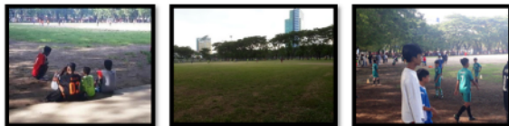
Fig. 5. Football activities.

The fifth performance sequence is occupied by softball, volleyball, and activities classified in category H (ceremonies, exhibitions, religion, fun walks, and leisure bikes) and category I (sitting activities with friends and family) by fulfilling two indicators, namely X1 and X8,