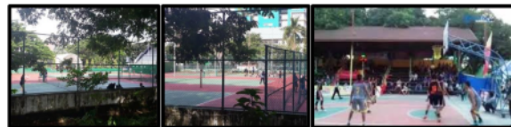
Fig. 6. Tennis & Basketball activities.