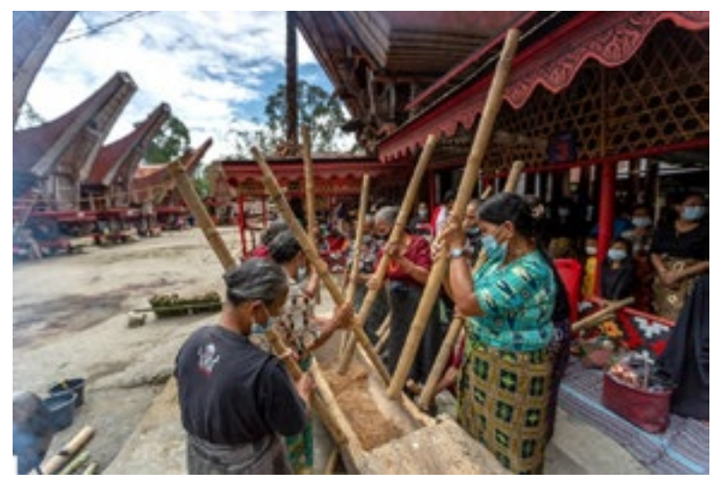
Issong (attraction of Toraja women pounding rice in a mortar)

A tourist object is an attractive place or location for tourists to visit and enjoy because of its beauty, historical value, cultural uniqueness, or activities that can be carried out in a particular place. Concerning tourist objects, at least we often hear the terms cultural attractions and natural attractions. Cultural tourism objects are places that have significant cultural values, traditions, and historical heritage. Examples include temples, shrines, palaces, traditional markets, cultural festivals, and villages. Tourists usually visit cultural attractions to learn about local culture, experience traditional ceremonies, and interact with local people.