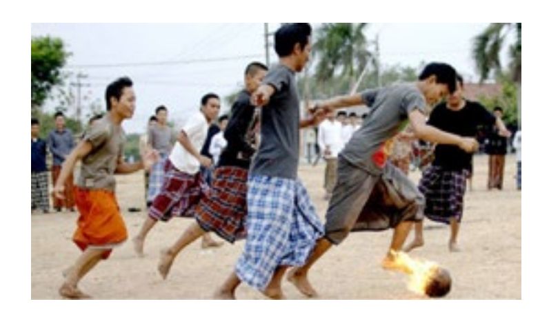
Fire football attraction

Indonesian culture is vibrant and diverse because this country consists of various tribes, languages, customs, and religions. Traditional arts such as wayang kulit, batik, dance, and sculpture are unique in Indonesian culture. Distinctive architecture, such as the Borobudur and Prambanan temples, also reflects a rich cultural heritage. Likewise, culinary diversity, traditional ceremonies, and festivals are integral to Indonesian culture.