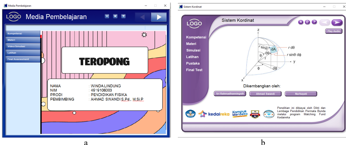
Figure 2. Learning applications that have been successfully developed training participants who follow online (a) and offline (b)

Figure 2.a is a physics learning application that was successfully developed by prospective teacher students after attending training and mentoring several times. While Figure 2.b is a mathematics learning application that was successfully made by the participants after attending the training. In addition to the ease of using Lectora which does not require proficiency in programming languages, one of the advantages is the various kinds of templates that can be used for free, making it easier to design learning applications. Some of these templates are also very attractive and equipped with various features that are quite helpful.