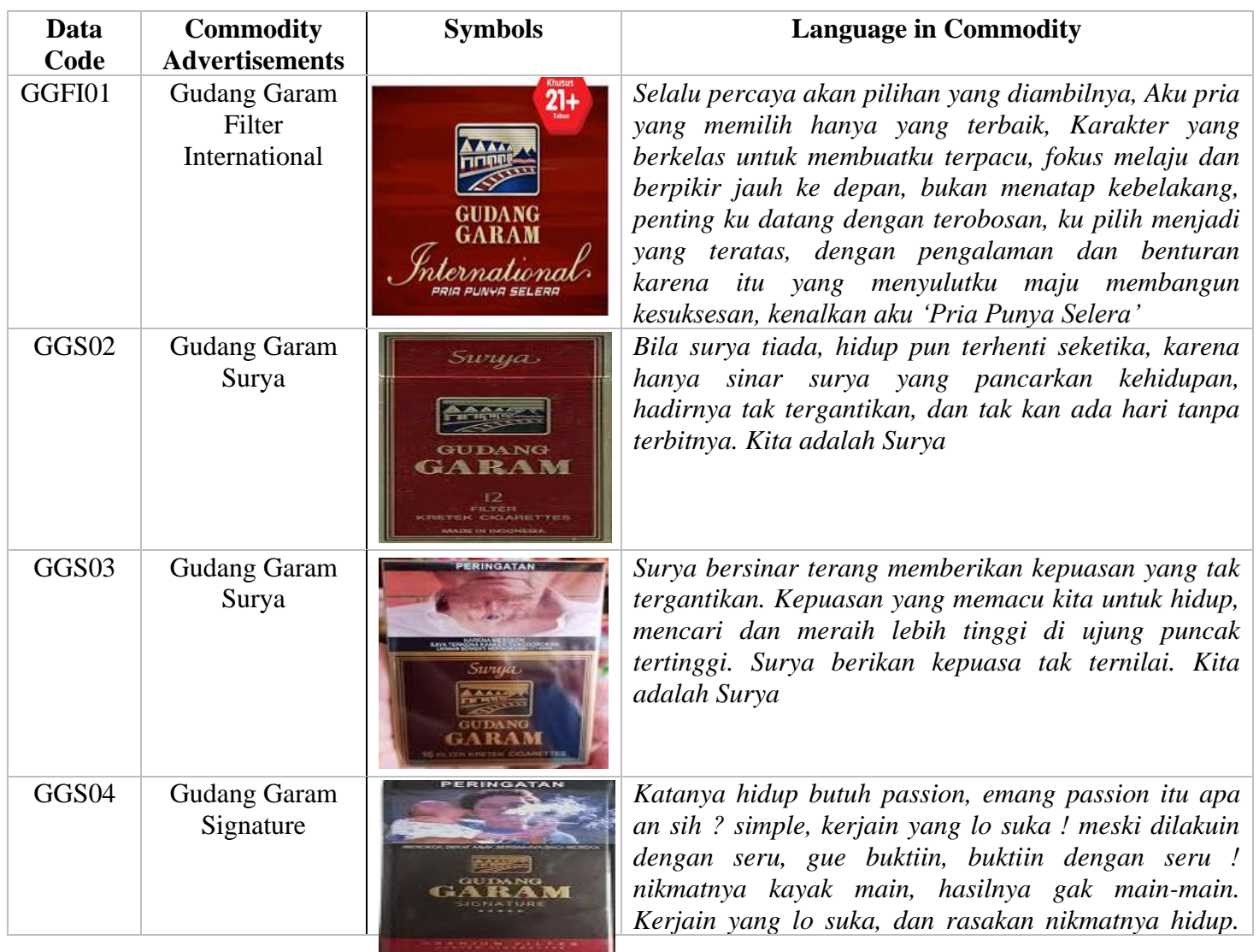
Table 1.1: Types, Symbols, and Language in Commodity Advertisements on Social Media

Additionally, the visual strategies and symbols used in advertisements also play a crucial role in reinforcing the community's identity. Colors, images, and designs not only support the linguistic message but also build associations between the product and a certain social identity. These visuals help the audience feel connected to the product and become part of a larger community. The role of social media in building social interactions related to advertisements is also highly significant. Social media platforms allow the audience to interact directly with the brand through comments, likes, and shared experiences. This strengthens the sense of community and extends the reach of community associations. Successful ads often encourage the audience to share their experiences or invite others to join the conversation about the product, deepening the social connections formed around the consumption of the product. Below is a table of commodity advertisements found on social media.