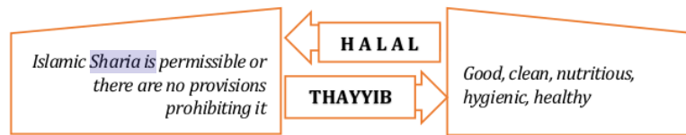
Figure 1. Standard Requirements for Consumption of Every Muslim.

Figure 1 explains that in the view of Islam the status of "halal and thayyib" are two aspects that must always coexist and their condition is fulfilled in every product to be consumed, meaning that everything that is halal must be thayyib, and vice versa, every thayyib must be halal, so that both of them must be ensured that their status exists and is fulfilled for any product to be consumed.