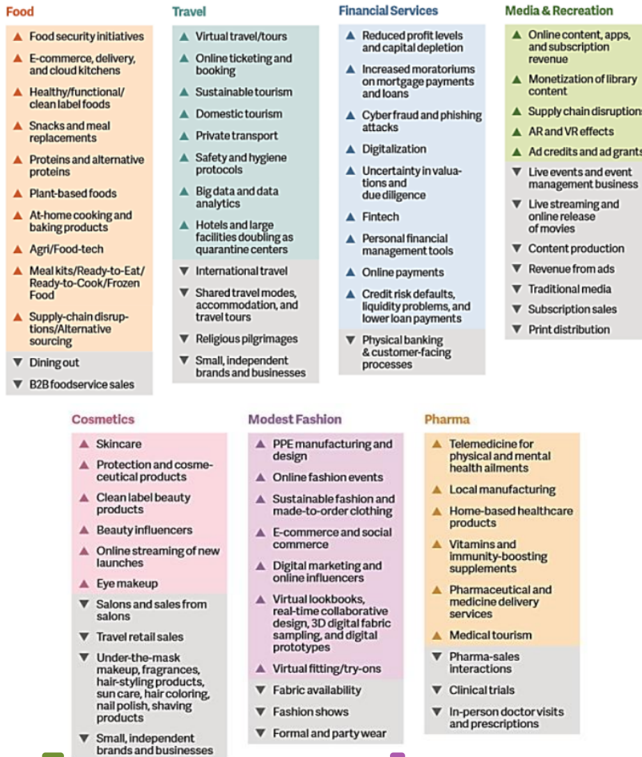
Figure 3. Impact of Covid-19 on the Islamic Economic Sector. Source: State of the Global Islamic economy 2020 - 2021

Apart from the halal tourism sector, other affected halal sectors such as trade, investment and Islamic banking. In the investment sector and Islamic banking, the amount of savings or investment has decreased, this is triggered by the purchasing power and saving power of the people that have decreased significantly as a result of the economic downturn caused by the pandemic. The decline in sharia business products has resulted in an increase in production costs, especially in obtaining raw materials for producing halal goods originating from abroad, which has an impact on layoffs of a number of employees.