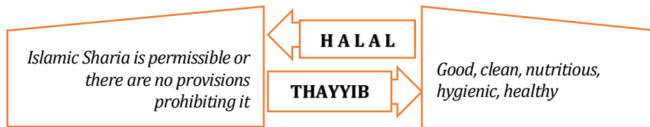
Figure 1. Standard Requirements for Consumption of Every Muslim.

Figure 1 explains that in the view of Islam the status of "halal and thayyib" are two aspects that must always coexist and their condition is fulfilled in every product to be consumed, meaning that everything that is halal must be thayyib, and vice versa, every thayyib must be halal, so that both of them must be ensured that their status exists and is fulfilled for any product to be consumed.