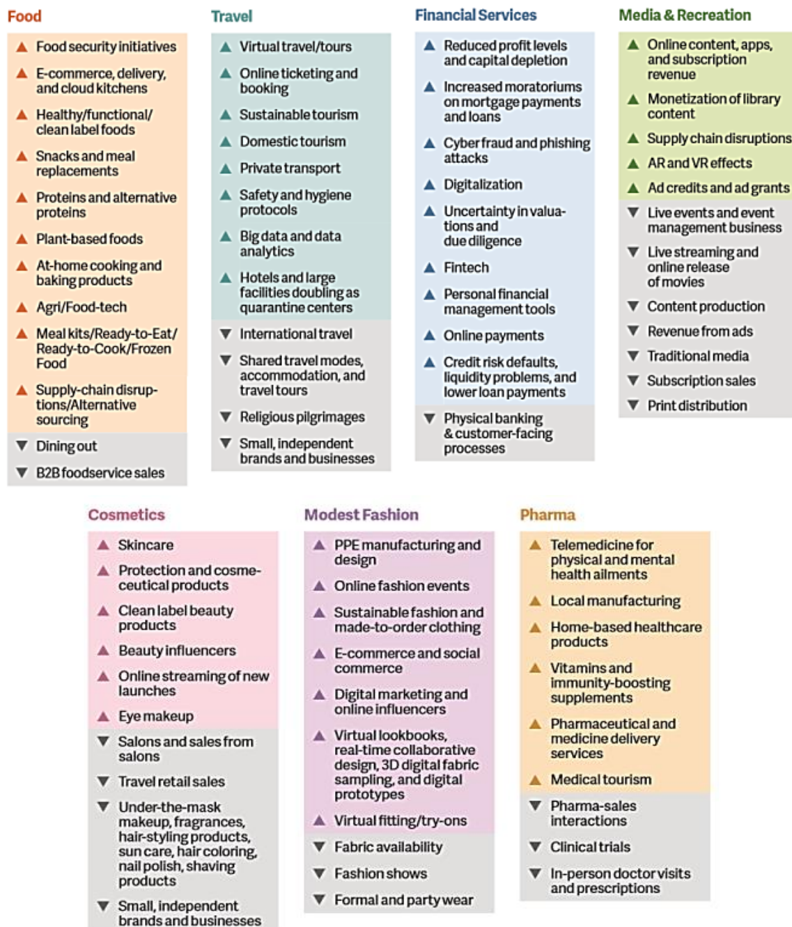
Figure 3. Impact of Covid-19 on the Islamic Economic Sector. Source: State of the Global Islamic economy 2020 - 2021

Apart from the halal tourism sector, other affected halal sectors such as trade, investment and Islamic banking. In the investment sector and Islamic banking, the amount of savings or investment has decreased, this is triggered by the purchasing power and saving power of the people that have decreased significantly as a result of the economic downturn caused by the pandemic. The decline in sharia business products has resulted in an increase in production costs, especially in obtaining raw materials for producing halal goods originating from abroad, which has an impact on layoffs of a number of employees.