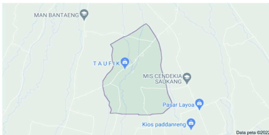
Figure 2. Map of Kaloling Village.

In general, the economic condition of Kaloling Village is mostly supported by the plantation and agricultural sectors, and the rest comes from outside the village and in general the people of Kaloling Village make a living as owner farmers, sharecroppers, civil servants, entrepreneurs, stone masons, carpenters, drivers, foot traders, five and farm and construction workers as well as several residents who migrated out of the area to earn a living.