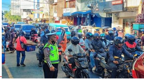
Figure 1. A. Congestion due to four-wheeled vehicles on Petta Rani Rd., Makassar, B. Congestion due to imbalance of road volume and number of vehicles on Veteran Rd., Makassar

Case resolution through restorative justice is a new thing for investigators, especially the traffic units. Prior to the issuance of Regulation of the Chief of the Indonesian National Police No. 8 of 2021, investigators handled traffic accident cases to transfer by transferring them to the prosecutor's prosecutor's office, office; which would then be forwarded to the court. this would then be forwarded to the court. However, if an agreement does not materialize between all parties with restorative justice, the investigator is obliged to carry in carrying out the process to be forwarded to the prosecutor's prosecutor's office.