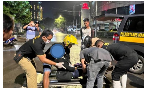
Figure 2. Examples of traffic accidents in Makassar. A. A collision between a city car and a truck due to negligence on a narrow road; B. Evacuation of motorcycle drivers who were victims of traffic accidents (Traffic Unit of Makassar City Police Resort, 2022)

The application of restorative justice which was carried out by the Traffic uUnit , which reachedreaching 1204 cases (92.76%), showed a positive light on the law enforcement process becausesince it saved costs, energy, and the number of detainees in its settlement. A traffic violator, LB, who caused the victim to suffer injuries and damage to his vehicle, stated: