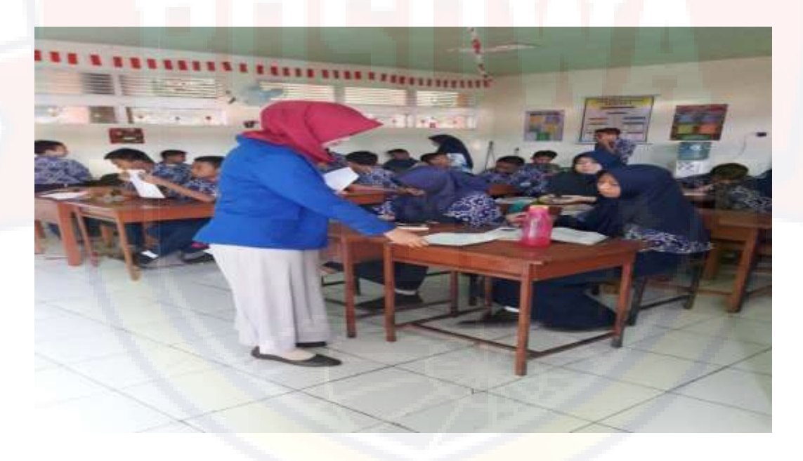
Picture 1.4 The writer was giving the explanation to one of the students who didn't understan.