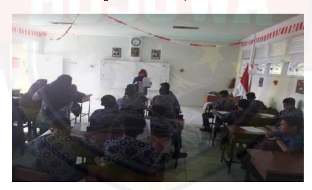
Picture 1.2 The writer was explaining the procedure of answer the questionnaire.