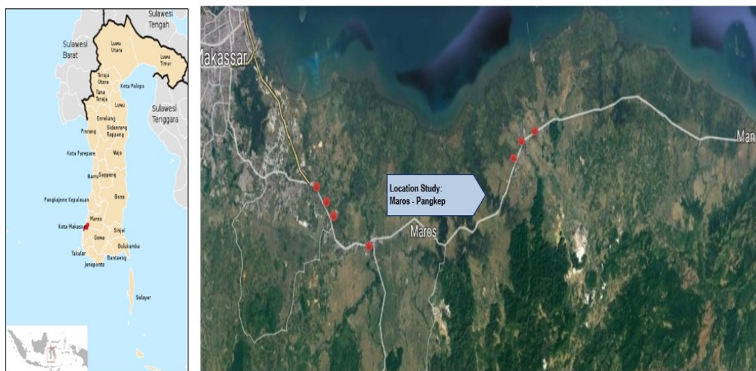
Figure 1. Location Study Maros Regency – Pangkep Regency

Research in Maros City 4 sample points, namely point 1 Sultan Hasanuddin Airport Roundabout, point 2 Maros City Gate, point 3 Grand Mall Batangase, and point 4 Traffic light Maros-Bantimurung. In Pangkep City, namely point 5 Bambu Runcing Pangkep, point 6 BRI Pangkep Office and point 7 Pangkep-Tonasa Traffic Light 1. Location and research points are shown in Figure 1.