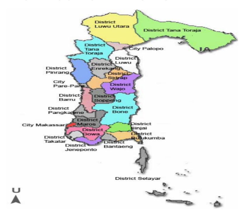
Fig. 1: Tourism locations in South Sulawesi Province (Anonymous, 2017)

Location research: This research was conducted at 140 tourism businesses in South Sulawesi Province. The researcher set three districts, namely Maros, Gowa and Toraja and three cities, namely Makassar, Pare-Pare and Palopo as the representative of the tourism business. The research was conducted on 110 tourism agencies and 30 travel agents (Fig. 1).