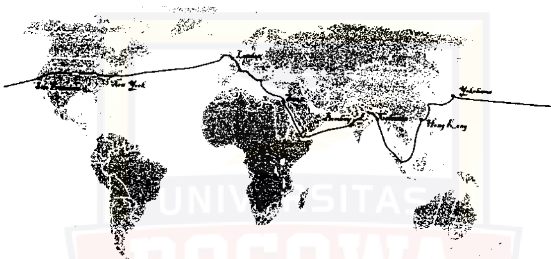
Map of the 80 day World trip by Phileas Fogg

excited about his work on the new book, the idea of which came to him one afternoon in a Paris café while reading a newspaper.