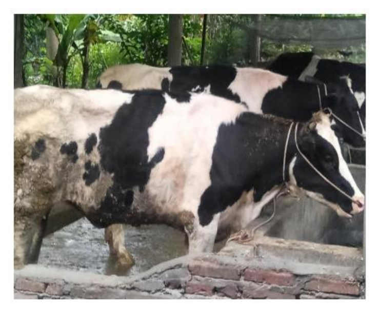
Figure 1. Dairy Cattle as a Commodity in Enrekang Regency, 2023

Figure 1 shows that dairy cattle in Enrekang Regency are kept exclusively because dairy cattle are used as a community commodity for their livelihood. Through processing cow's milk which is then processed with various forms of food and other processed chips. Apart from that, dairy cow's milk can also be bought and sold by local people and become additional income for the community. Dairy cows have various benefits both in terms of the milk produced and in terms of community use as a commodity. With the presence of dairy cows that are raised by the community, it is also possible to open up employment opportunities for the community. Dairy cow milk will increase in quality and quantity if wholesalers/KUD guide farmers, in addition to providing cooling units in villages that are far away so that sales do not go to collecting traders and shorten the time for milk to arrive- cooling units (Setiyowati, 2020). Apart from that, the distribution of the dairy cattle population in Enrekang Regency is very growing, as can be seen in the table below.